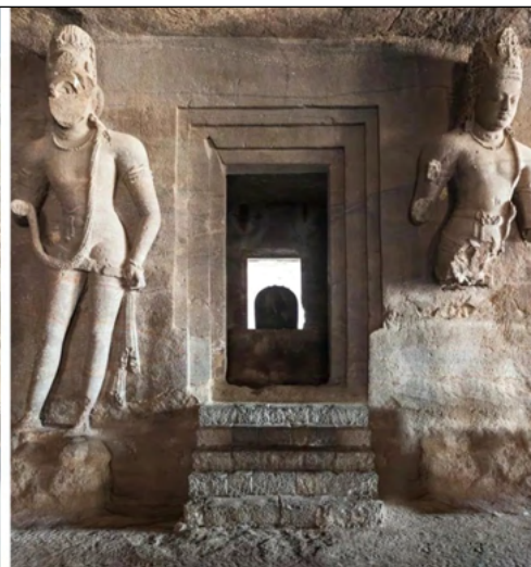
AI-powered 3D mapping reveals hidden architectural details at centuries-old Indian monuments.

India has a rich cultural heritage spanning centuries. However, one major issue confronting the stakeholders is its preservation for posterity. However, the usage of Artificial Intelligence, is helping our country resolve this problem.